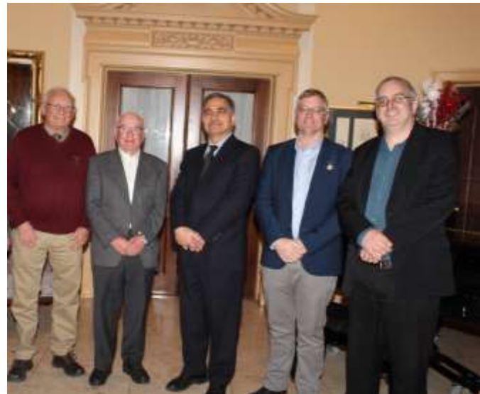
Some of the Past Presidents of Engineers PEI take time for photos at the 2018 Engineers PEI AGM Awards Banquet