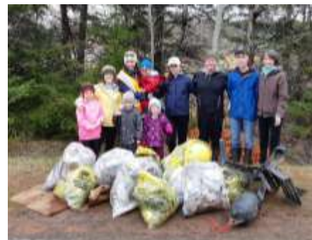
Two of the Engineers PEI volunteer teams taking part in the Women's Institute Annual Roadside Cleanup