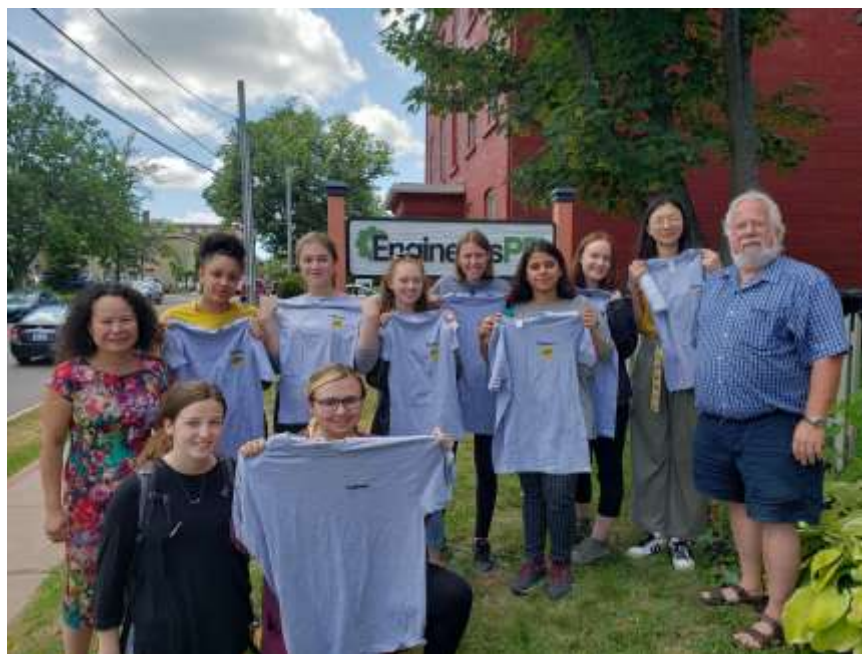
Grades 11 and 12 high school students participating in ProGRES (Promoting Girls in Research in Engineering and Sustainability) 2019 on a lunch visit to Engineers PEI