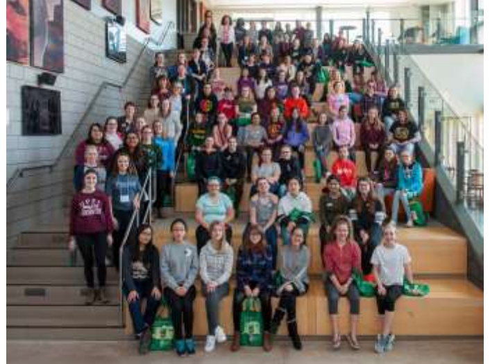
Participants and Mentors of the 2019 Girls Get WISE Science Retreat