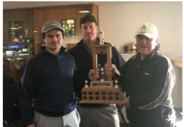
The Hall Team - the winners of the 2019 Engineers PEI Annual Golf Tournament