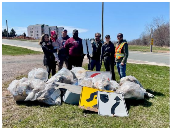
Volunteers from Coles Associates taking part in the 2023 Women's Institute Roadside Cleanup.